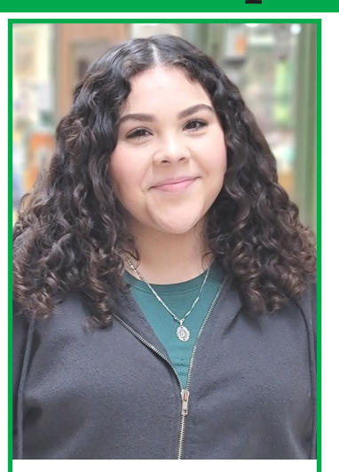
"PBIS is a win-win because the staff are appreciating you and you're getting rewarded."